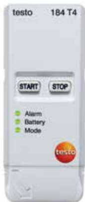
testo 184 T4