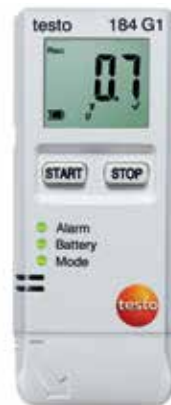
testo 184 G1