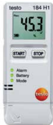
testo 184 H1