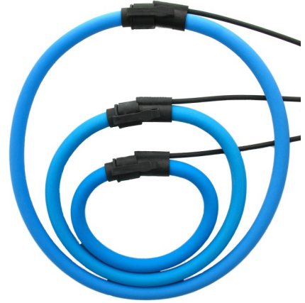
DENT's RoCoil Current Transformers. 16", 24", and 36" lengths pictured.

Visit the DENT website or contact us for further information.